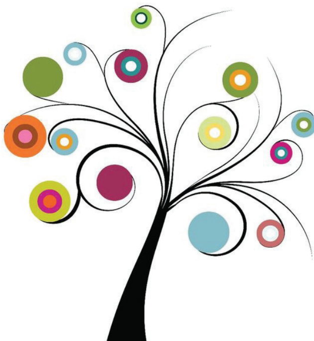
The USF Diabetes Center