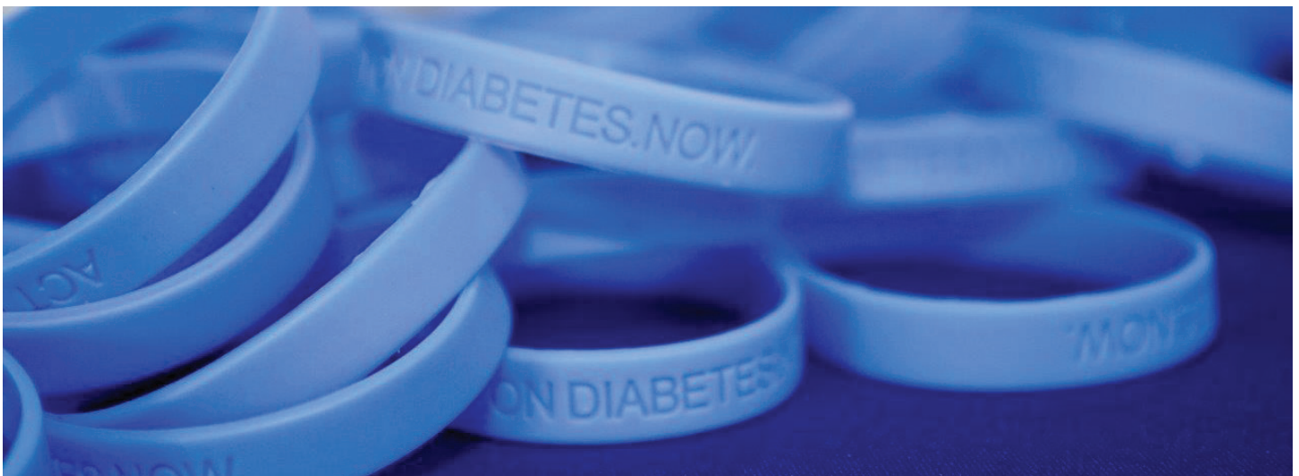
Rubber bracelets – in the official blue that signifies diabetes – were handed out on World Diabetes Day at the official center opening in 2011.

She knows the challenges well, having been diagnosed with Type 1 diabetes at age 9 and a patient at the center since her early teens. She even spoke at the ribbon-cutting ceremony five years ago.