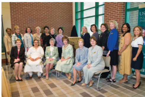
A group of WLP Founding Members, pictured in 2005.

It is there that the heart of giving beats into a new decade of women making a difference.